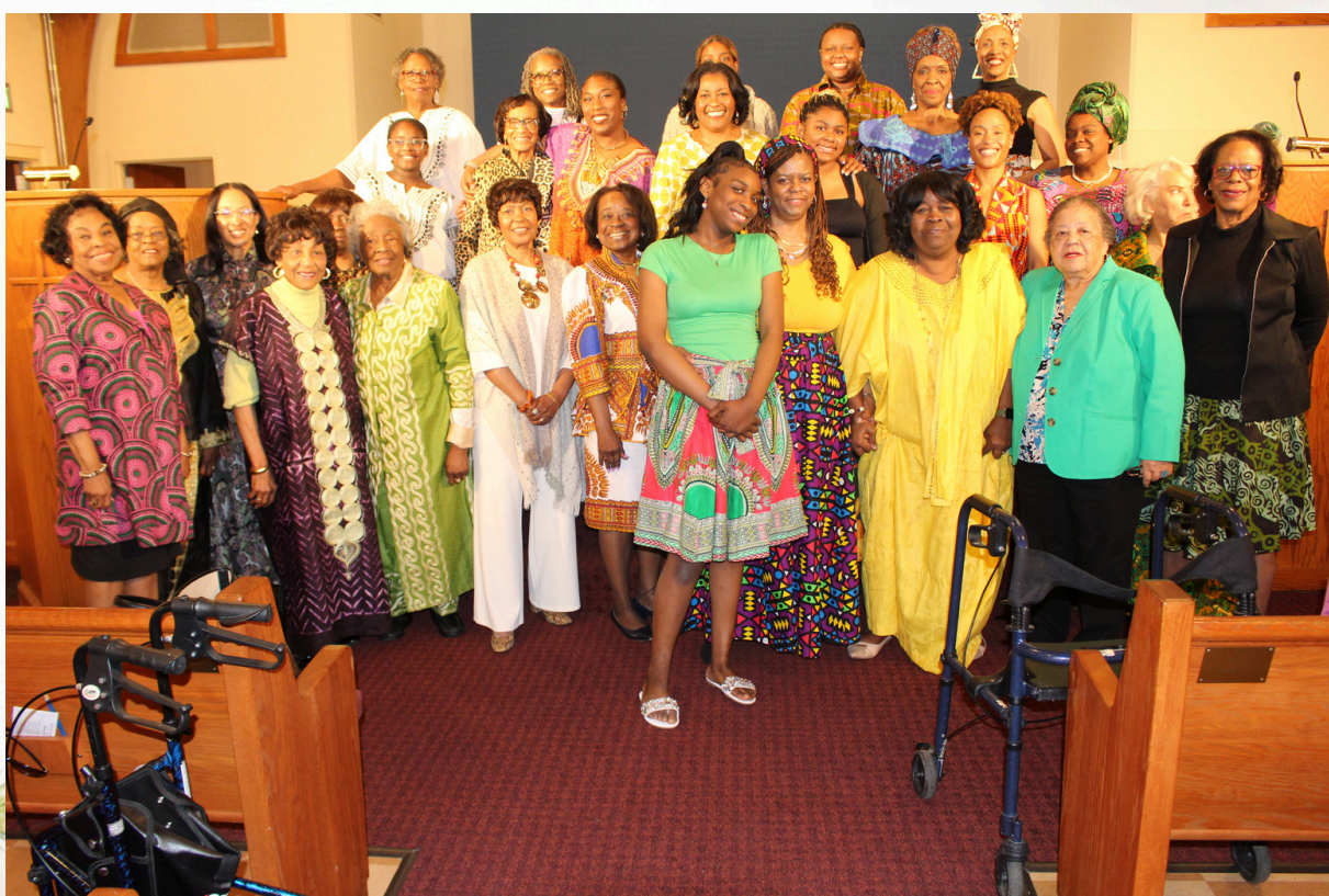
Radcliffe Presbyterian Women